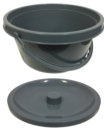
Bucket & Lid